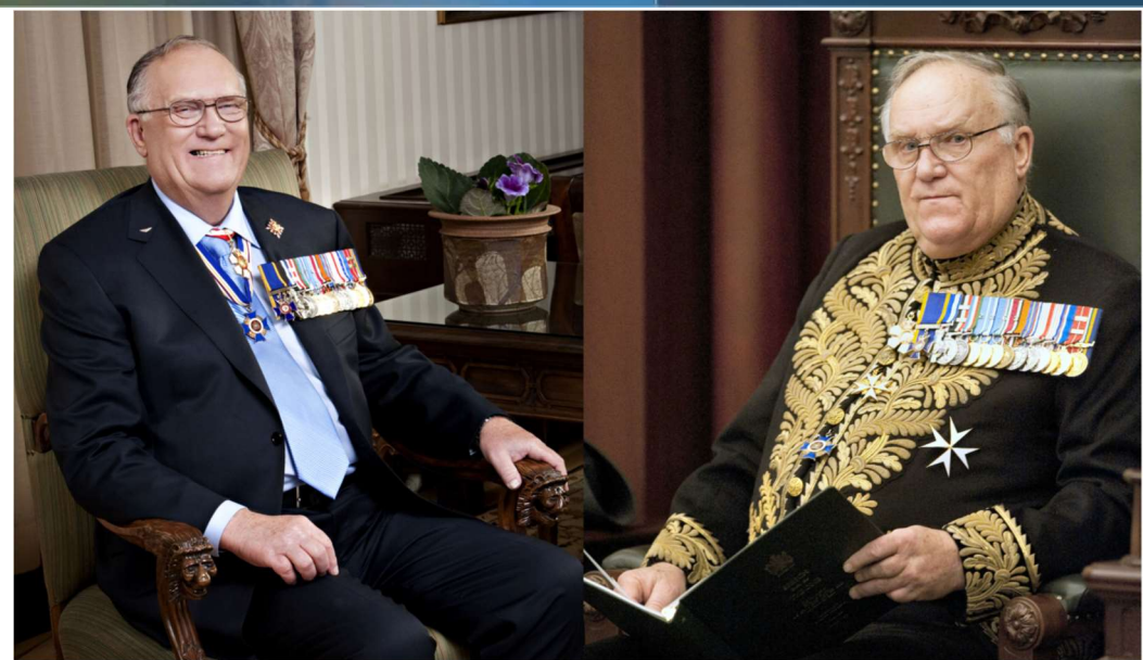
The Honouarable Don Ethell, OC, OMM, KStJ, AOE, MSC, CD