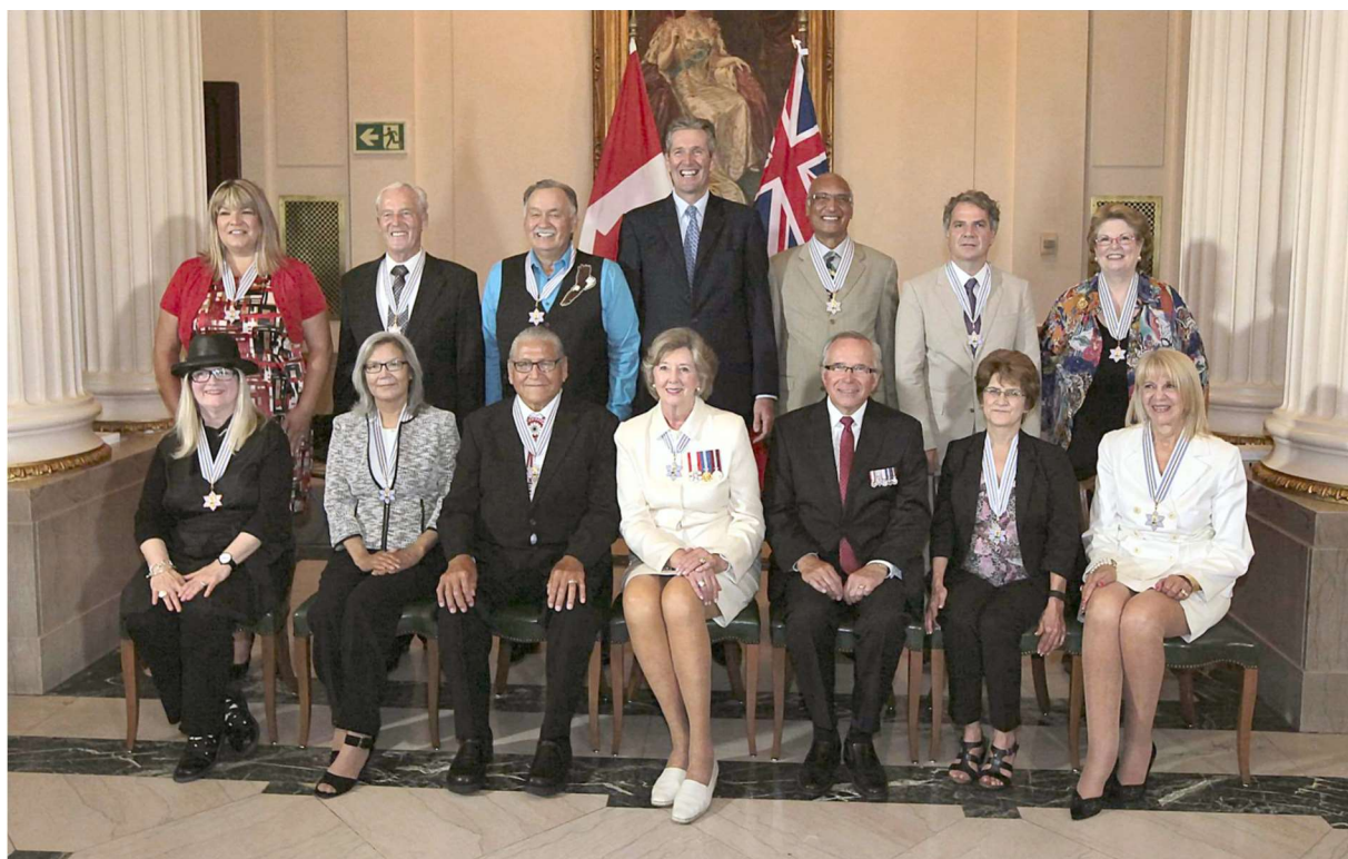
Order of Manitoba 2016