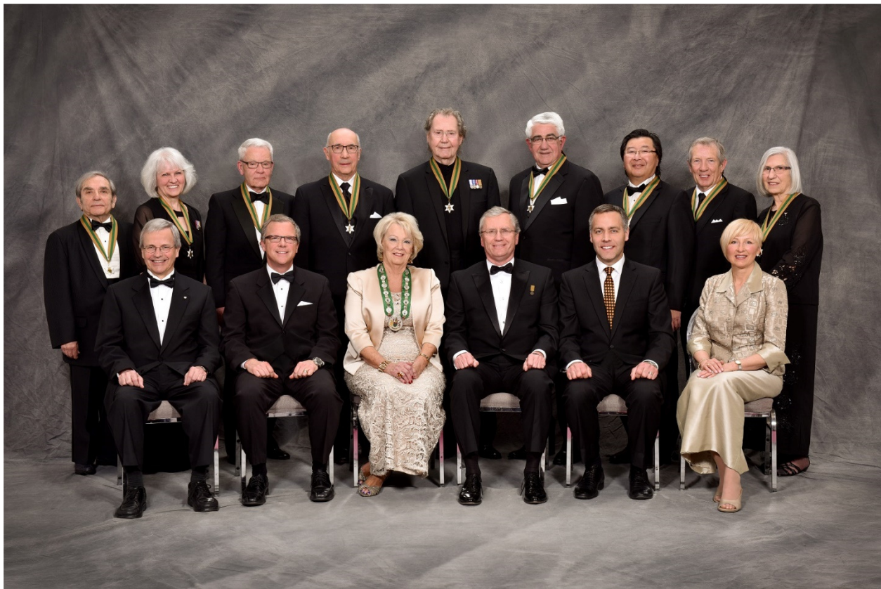
2014-2015 recipients of the Saskatchewan Order of Merit