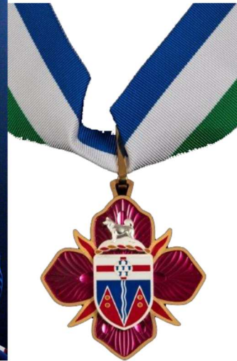
Honourable Adeline Webber, OY 37 th Commissioner of the Yukon