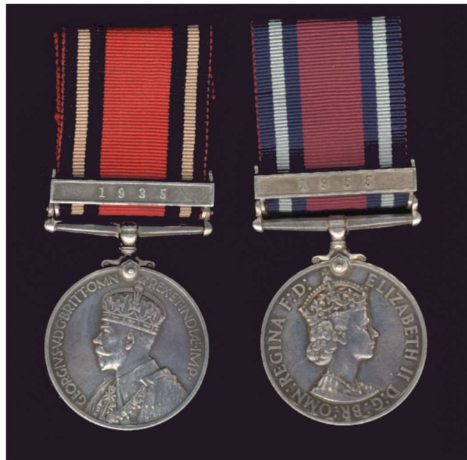
King's Medal for the Canadian Army 1935 Queen's Medal for the RCAF 1956

As a Flight Lieutenant in the RCAF, he won the RCAF Queen's Medal in 1955.