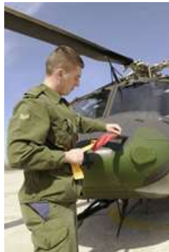
Corporal Marc Turcotte-Sorbonne