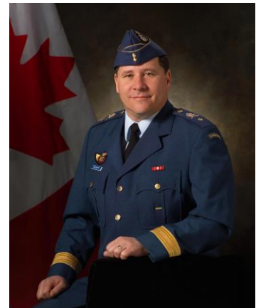
BGen Claude Rochette, CD