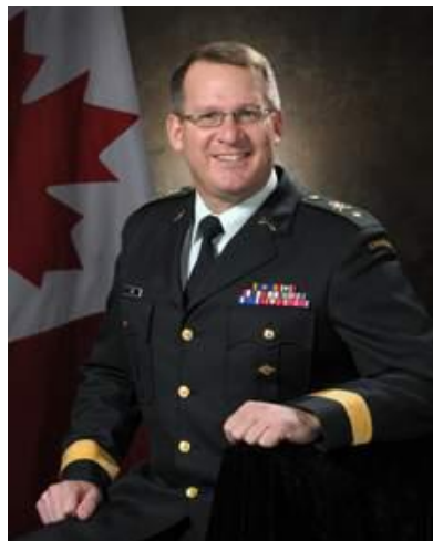
Brigadier-General Craig King, OMM, MBE, CD