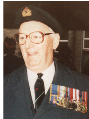
Service & Medal