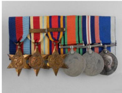
Medals of CPO1 Roger Unwin, RCN LS&GC Medal (CD)