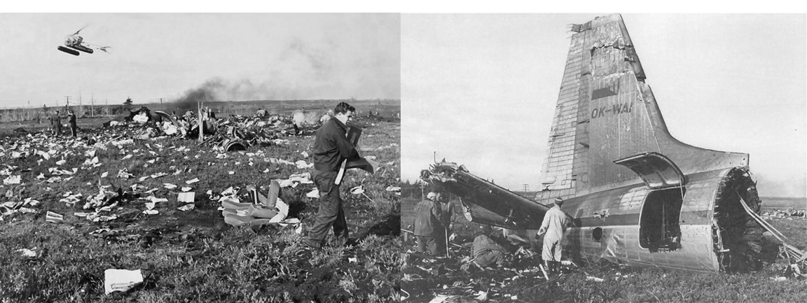
Canada Gazette citation reads:

"At approximately 2:40 a.m., Tuesday, September 5, 1967, a Czechoslovak aircraft crashed shortly after taking off from Runway 14-32 at Gander International Airport. The aircraft crashed about 3,762 feet from the end of the runway and the wreckage came to a rest about 5,344 feet from the end of the runway. This area is almost entirely bog and very dangerous to walk on at night. It is stated that several of the rescue workers, including the Fire Chief at the Airport, stepped into holes and sank up to their waists before being pulled out. The remains of the aircraft were about 1,980 feet from the nearest road and it was impossible to get rescue vehicles across the bog to the scene. It would have taken hours to carry all of the injured out across the bog. It was accordingly agreed among the Airport management that a helicopter would cut down on the suffering and speed up the rescue operations, and one was therefore obtained with it pilot, Mr. Garrett.