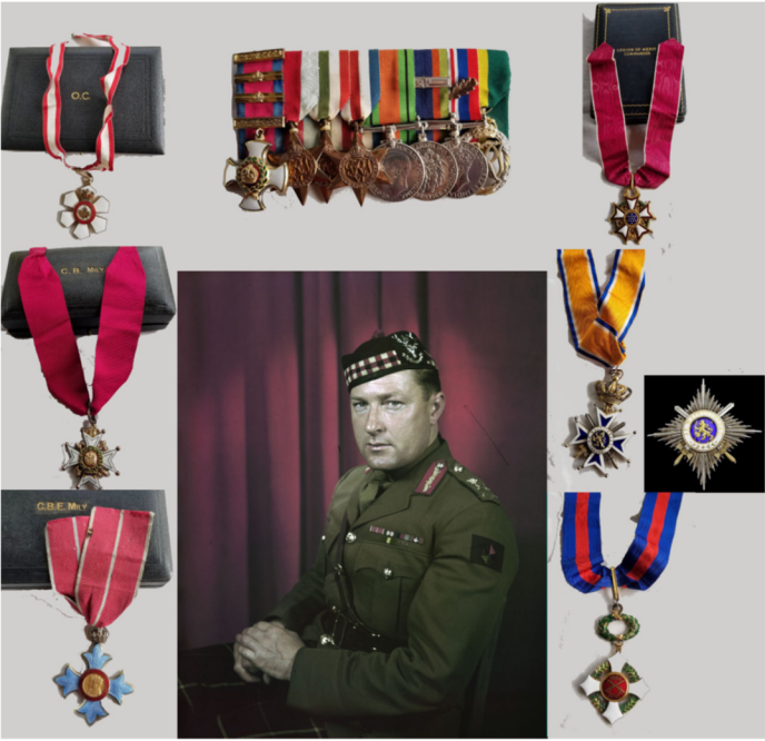
Major-General Bertram Meryl Hoffmeister, OC, CB, CBE, DSO and 2 Bars, ED