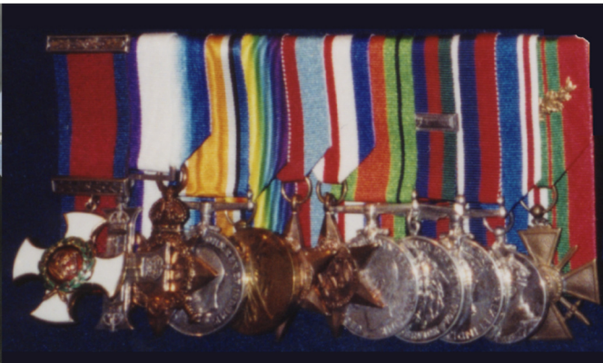
MGen John Hamilton Roberts, CB, DSO (Dieppe)