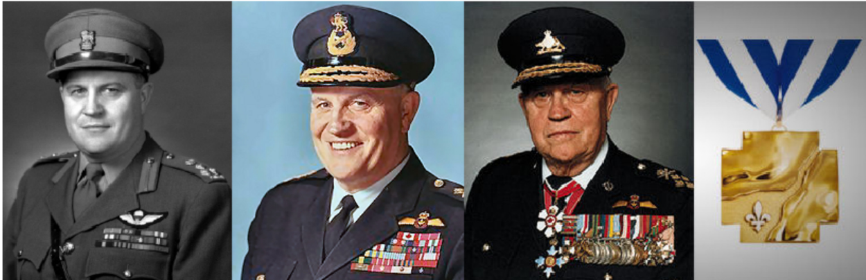
General Jean Victor Allard, CC, CBE, DSO and 2 Bars, GOQ, CD