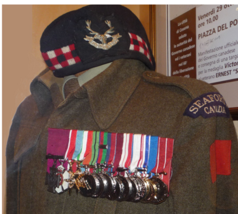
Private Ernest (“Smokey”) Smith, VC, CM, OBC, CD