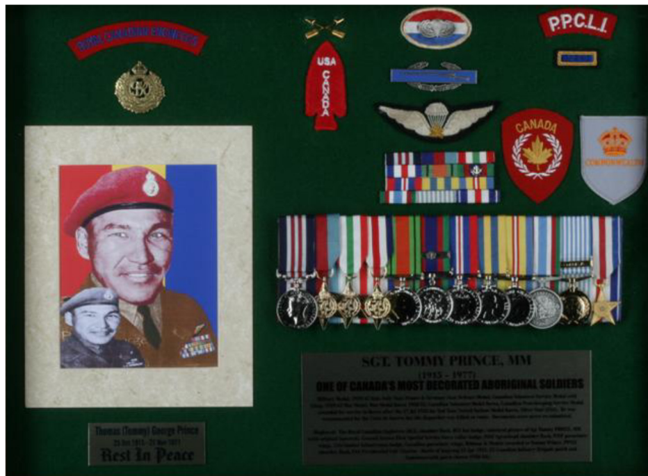
Acting Sergeant Thomas "Tommy" George PRINCE, MM, 1 st Special Service Force USA Silver Star WWII