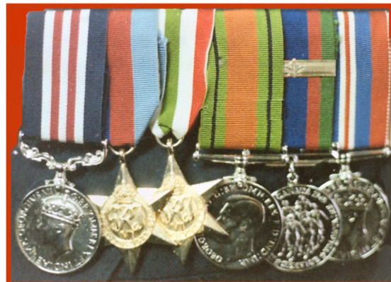
Private Benoit PITRE, MM, Cape Breton Highlanders