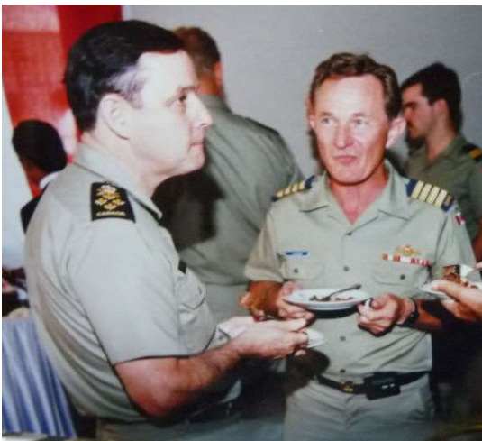
General John de Chastelaine with Colonel Romeo Lalonde wearing summer uniforms

MEDALS: MSC - Gulf with Bar - SSM with bar NATO – Multi-National Force - Centennial - CD & Bar – Liberation Kuwait (2 nd Class) (Kuwait)