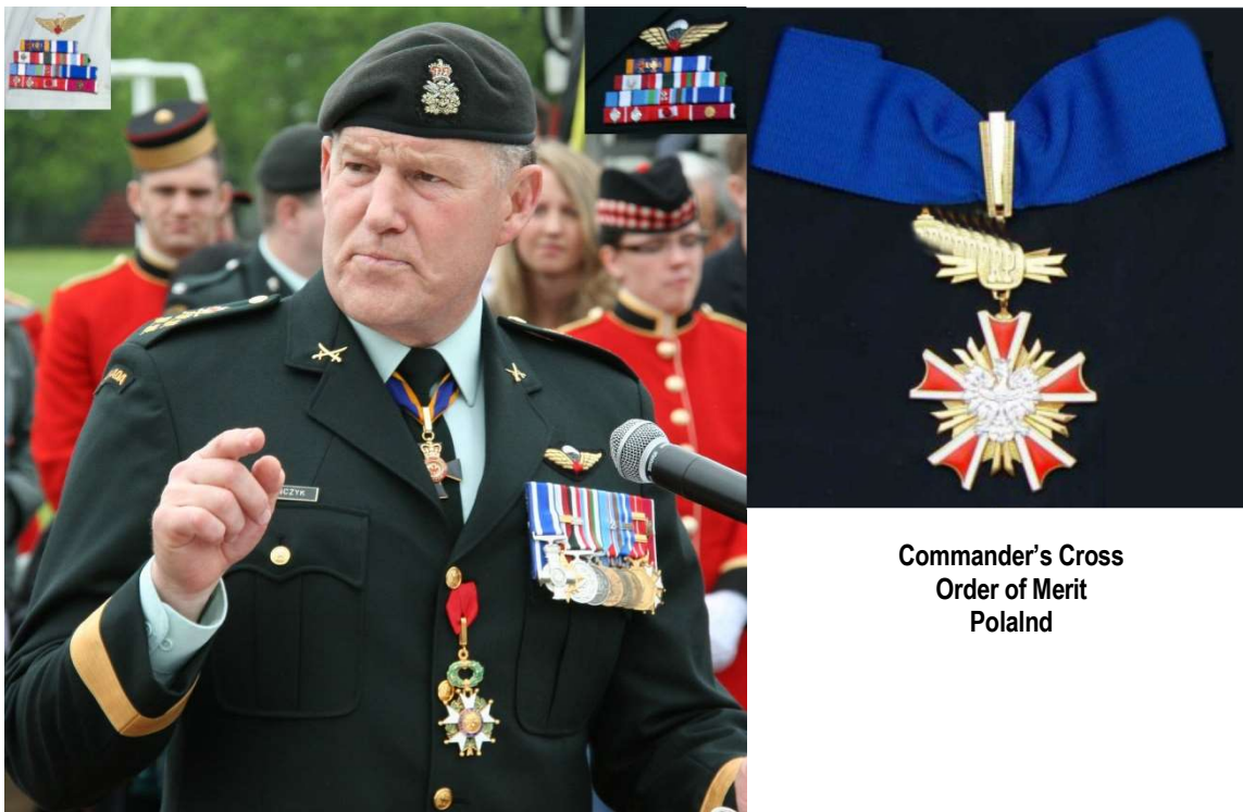
Commander's Cross Order of Merit Poland