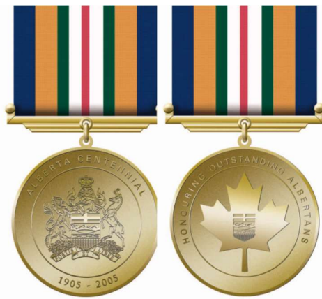
Alberta Centennial Medal

Medals: MSC – SE Asia bar Afghanistan – SSM bar NATO – Peacekeeping – UN Cyprus – UNDOF - UNPROFOR – CD and Bar – Alberta Centennial