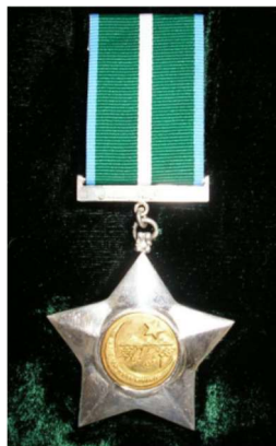
Sitara-i-Eisaar (Star of Sacrifice) of Pakistan