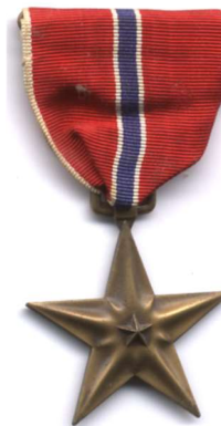
Bronze Star (USA)