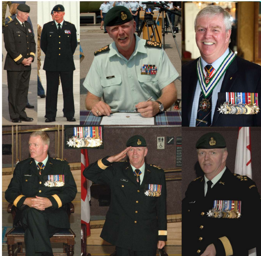
General Richard ('Rick') J. HILLIER, Richard, CMM, OStJ, ONL, MSC, CD