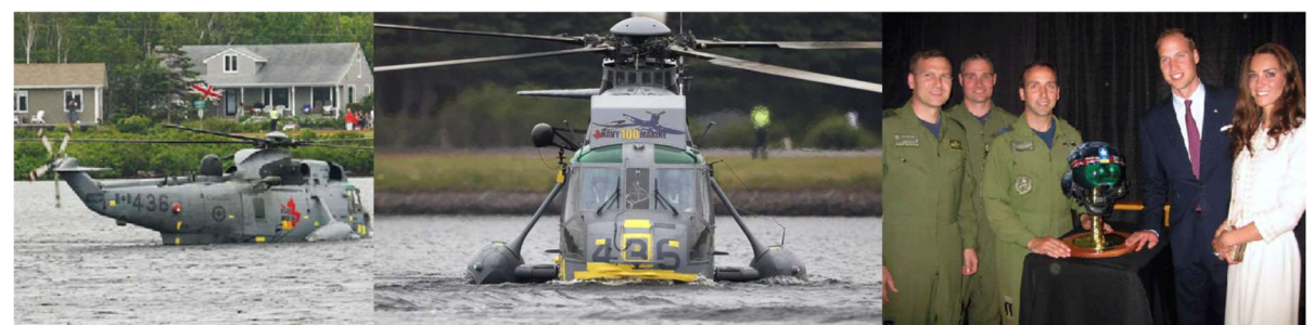
Prince William making water landing in a 12 Wing Sea King

Commanded 12 Wing (Shearwater) in 2013 - retired