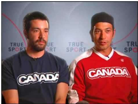
Brian (left) and Robin (right) McKeever

“Skiing together since childhood, brothers Brian and Robin McKeever achieved a hard-won synchronicity—Brian as a visually impaired Nordic skier and Robin as his sighted guide—which brought them triple gold medals at the Vancouver 2010 Paralympic Winter Games. Together, they pushed the boundaries of both the Paralympic and Olympic games and altered the lines which had segregated able-bodied and disabled athletes.”