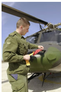
Corporal Marc Turcotte-Sorbonne