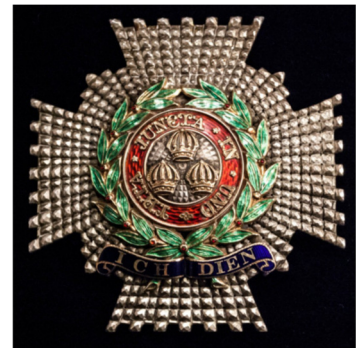
KCB Military Star

The Military Star is 57-mm wide and high, in the shape of a silver cross pattée, with laurel wreaths in green around the central part of the badge and with the motto and the blue enamel scroll below with ICH DIEN in gold. A neck badge (51-mm wide) is also worn.