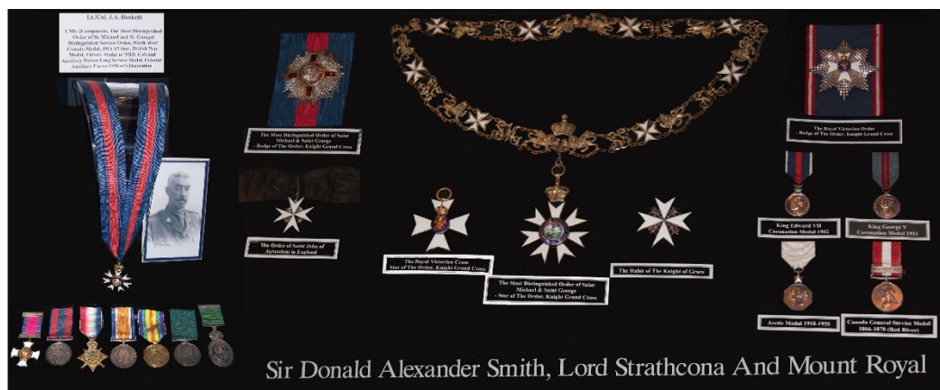
Sir Donald Alexander Smith, Lord Strathcona And Mount Royal