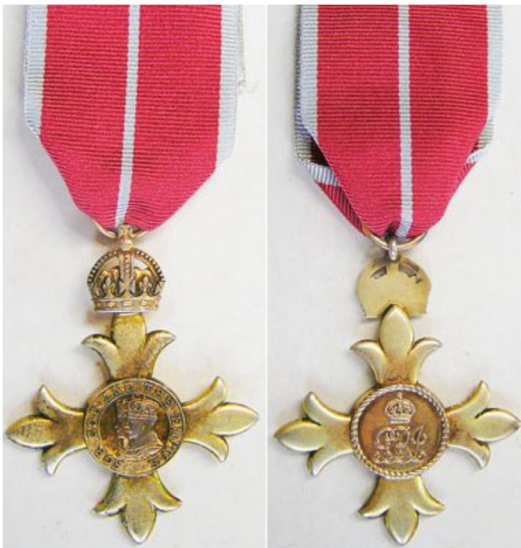
(MBE Military 1st Type below)