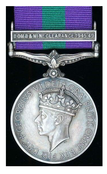
General Service Medal