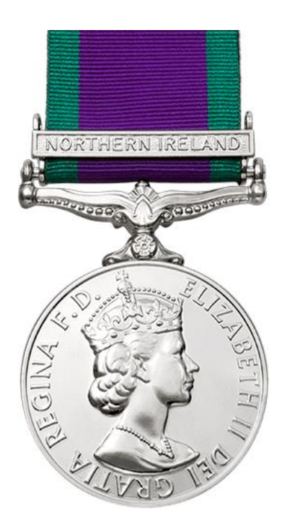
Campaign Service Medal