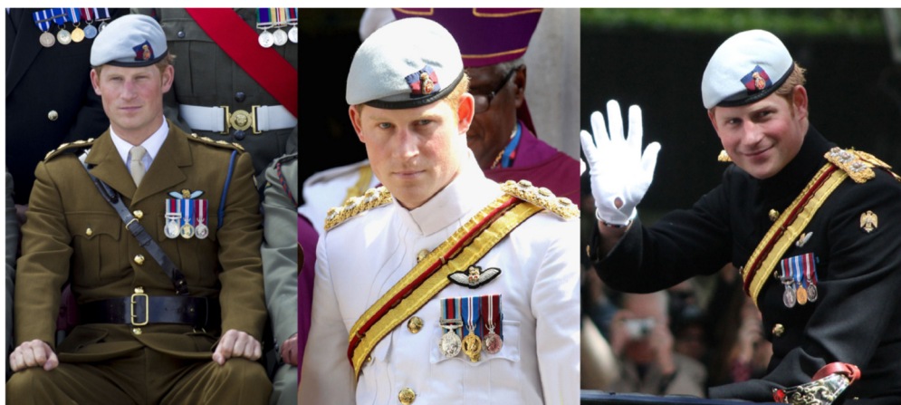
Prince Harry wearing his Operational Service Medal with bar Afghanistan in 3 different British Army Uniforms (full title Prince Henry of Wales, Henry Charles Albert David)