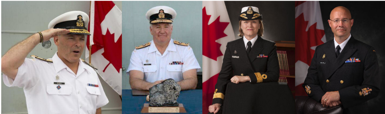
Commodore Craig Baines, CD