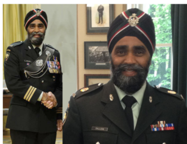
LCpl The Honourable Hajit Sajjan, OMM, MSM, CD, Minister of National Defence

* Position is also the CHIEF MILITARY ENGINEER