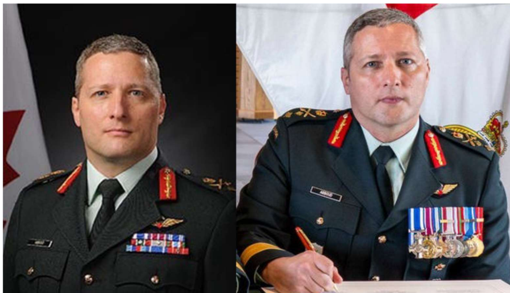
Brigadier-General Joseph Antoine Dave Abboud, MSC, MMV, MSM, CD

Page Totals 2 27 3 14 4 24 5 19 6 6 Not Gazetted Total: 90 (includes 6 names not gazetted and 2 to the US Army)