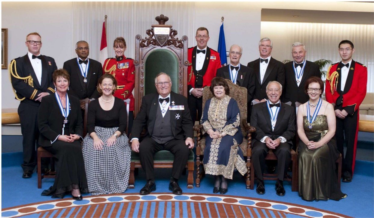
2011 AOE Recipients