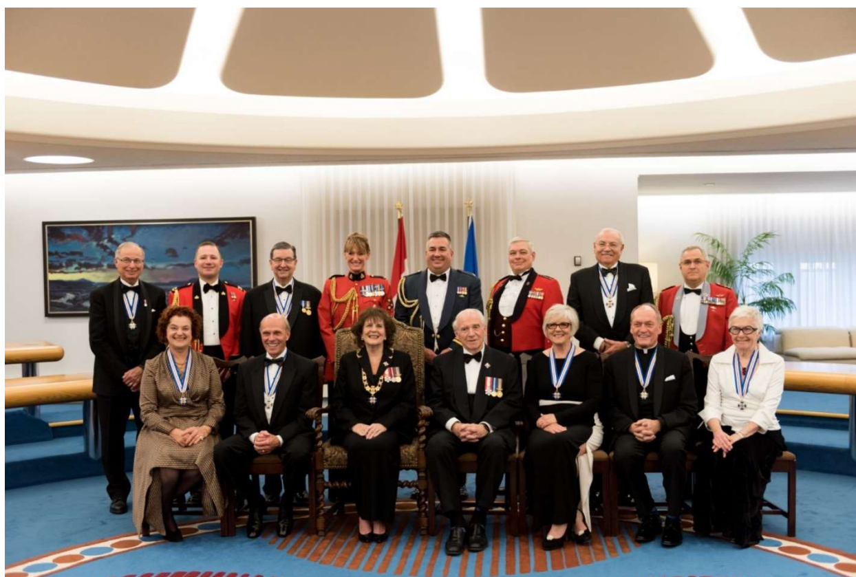
2017 AOE Recipients