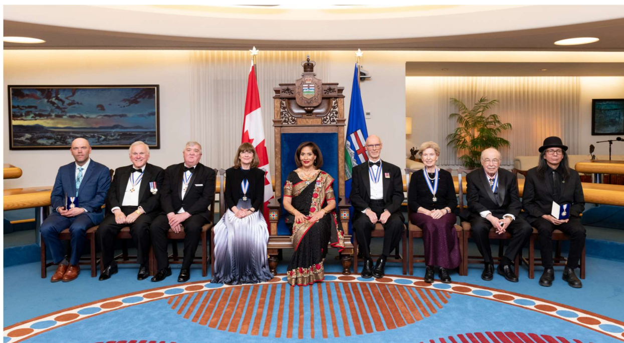
2021 AOE Recipients