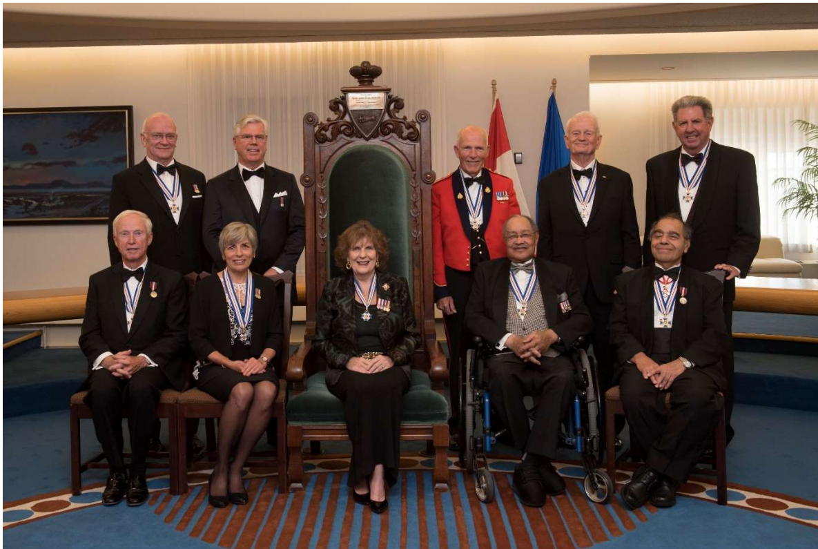
AOE Recipients - 2015