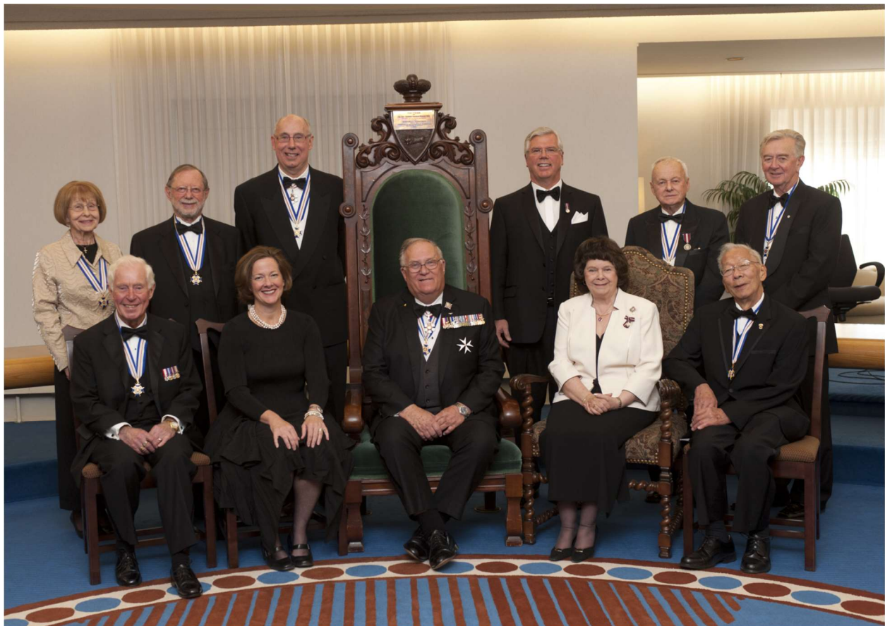
AOE 2012 Recipients