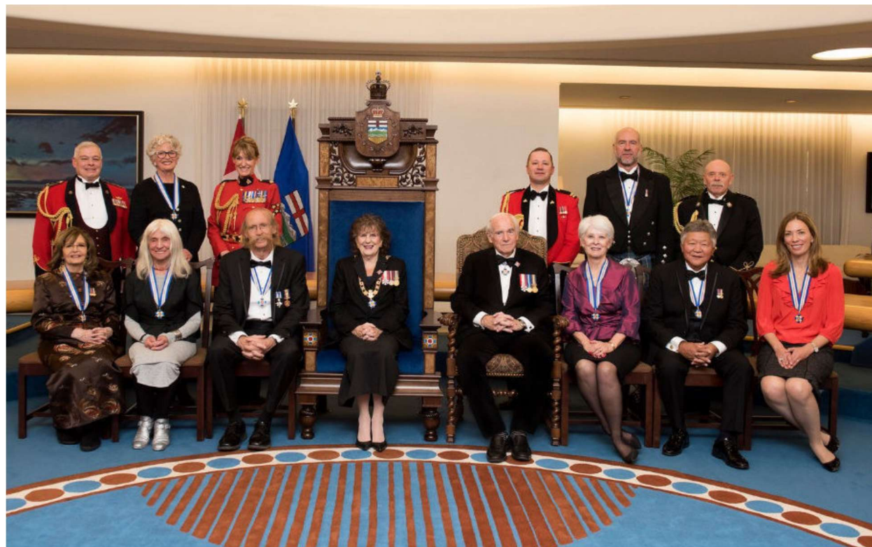
Alberta Order of Excellence (AOE) – 2019