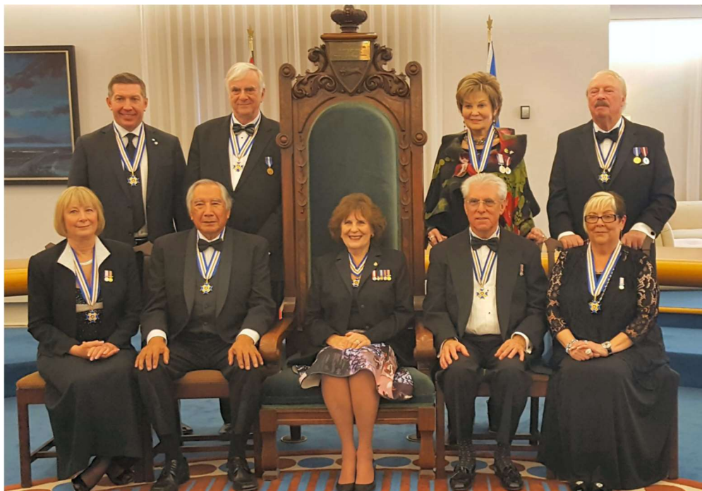
AOE – 2016 – Recipients