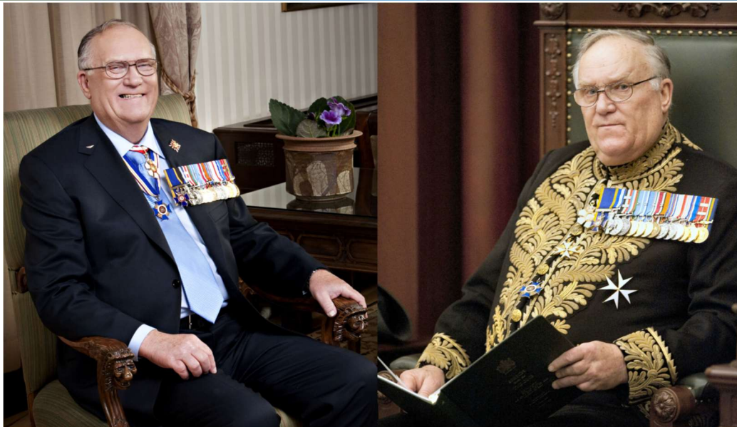
The Honourable Don Ethell, OC, OMM, KStJ, AOE, MSC, CD