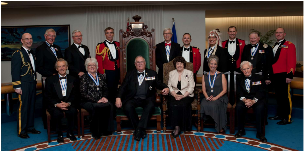
2014 AOE Recipients