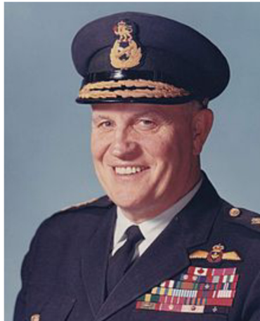
General Jean Victor Allard, CC, CBE, DSO & 2 Bar, GOQ, ED, CD