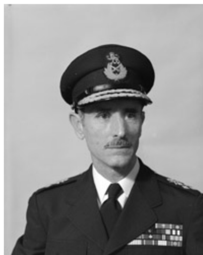
BGen Jacques Dextraze, CBE, DSO, CD