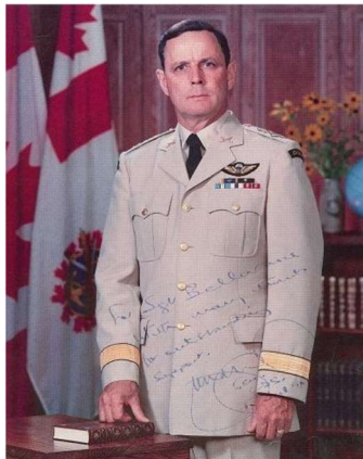
BGen John de CHASTELAIN, CMM, OC, CH, CStJ, CD