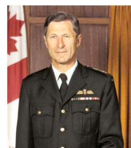
LGen Charles Theriault, CMM, OStJ, CD