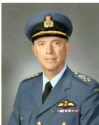
General Paul Manson, OC, CMM, OSTJ, CD