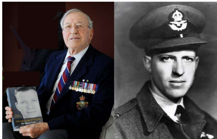
The Honourable Gilles Lamontagne, PC, OC, KStJ, CQ, CD, MP