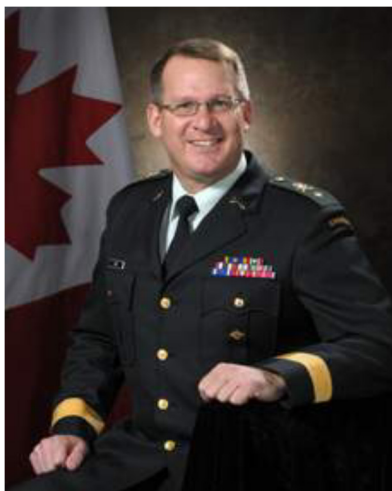
Brigadier-General Craig King, OMM, MBE, CD