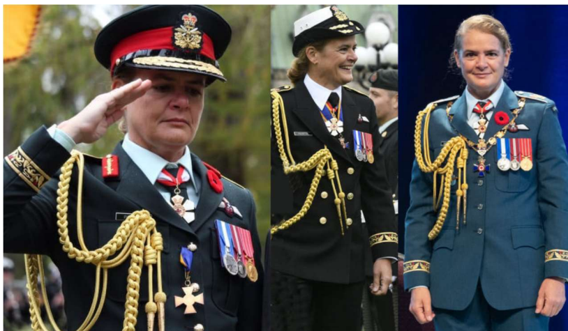
HCol the Right Honourable Julie Payette, CC, CMM, COM, DStJ, CD