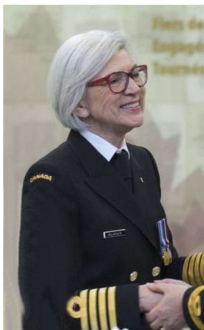
HCaptain The Right Hon Beverley McLachlin, CC, DStJ