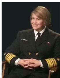
Deputy Minister Jody Thomas while CCG Commissioner

* Position is also the CHIEF MILITARY ENGINEER