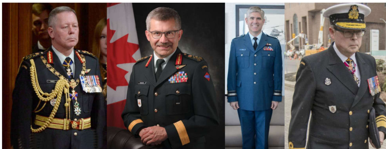
Vice-Admiral Mark Norman