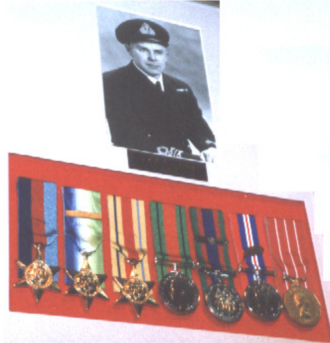
Medals are displayed at Nanaimo Military Museum

1939/1945 Star - Atlantic Star with Bar France and Germany - Africa Star - Defence Medal - Canadian Volunteer Service Medal with Clasp - 1939/1945 War Medal with MID - CD