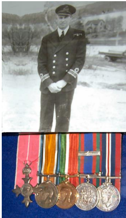
Medals are on display at HMCS Tecumseh Museum in Calgary, Alberta.

MBE - British War Medal - WW1 Mercantile Marine Medal - CVSM and Clasp - 1939/45 War Medal.