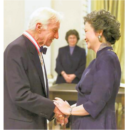
Jack McClelland and GG Adrienne Clarkson

"A legend in Canadian publishing, he has engaged the world in celebrating our writers. Head of McClelland & Stewart for more than 30 years, he steered the company towards a domestic focus and launched the careers of many of our best authors. With originality and passion, he promoted new works and he initiated the New Canadian Library reprint series, ensuring the continued accessibility of classic novels. A recipient of countless honours, he is recognized for broadening the awareness and appreciation of this country's history and culture."