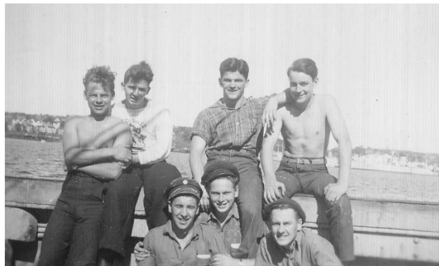
Crew of the HMCS Beaverton